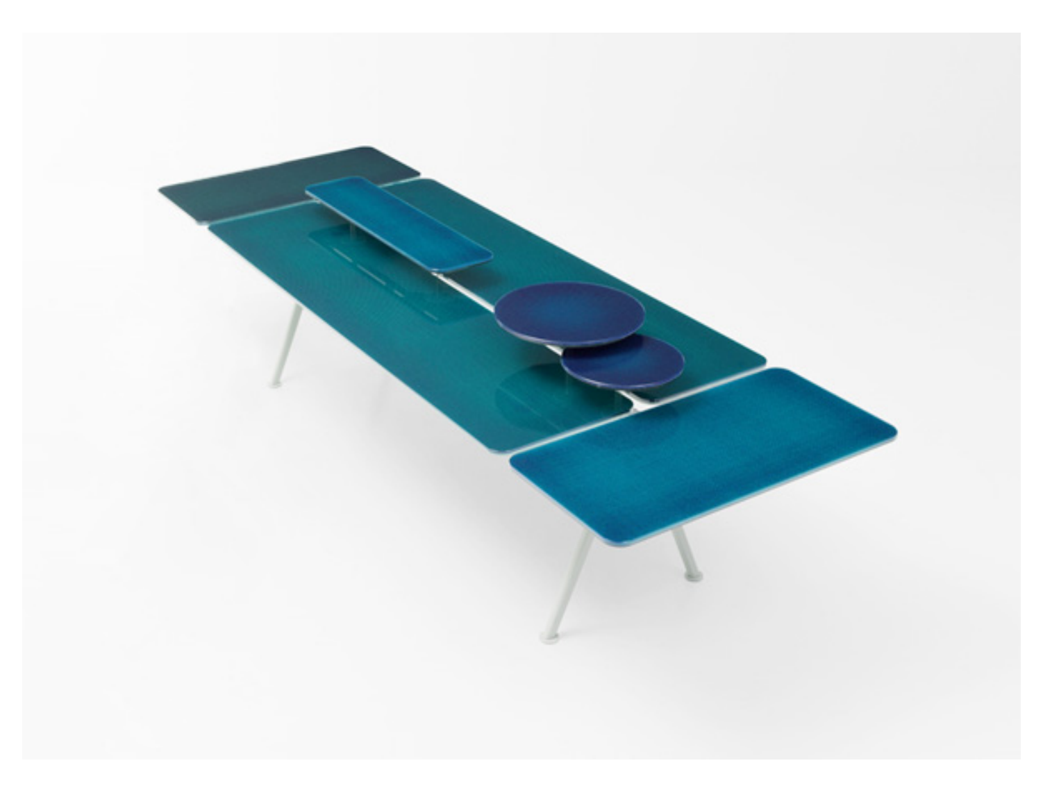
Table with aluminium base, tops and accessories in stoneware or glass.

Base: gloss varnished legs and joints in cast aluminium, gloss varnished central plank under the top in extruded aluminium (reference colours: Mano Lucida wood sample collection). Adjustable aluminium feet.