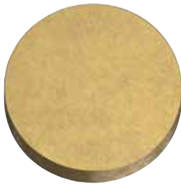
Q7 - Pure Brass PVD