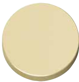
P6 - Matt British Gold PVD