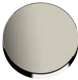
95 - Polished Nickel PVD