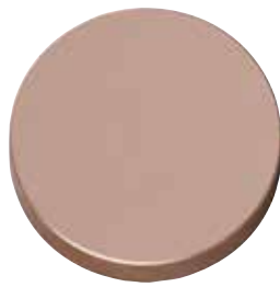
P9 - Matt Copper PVD