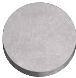
Q8 - Raw Metal PVD

Physical Vapor Deposition (PVD) is a technique used to apply a thin-film coating to a surface, creating a hard, durable, and hypoallergenic finish. Thanks to these qualities, the technique is used in a wide variety of applications, from everyday objects like drill bits and cutlery to jewelry and fashion complements, and even parts for the automotive and aerospace industry.