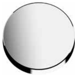
02 - Chrome