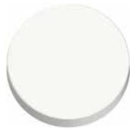
29 - Matt White RAL 9016