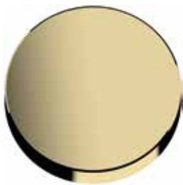
01 - Gold Plus 0,1-0,2 µm deposit of 22-23 gold karats