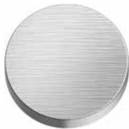
93 - Brushed Stainless Steel AISI 316/316L