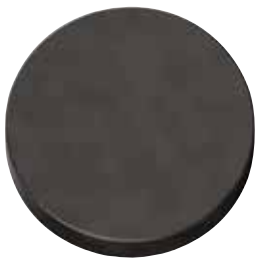
S1 - Deep Black PVD