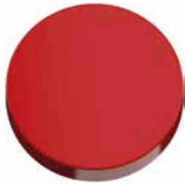
06 - Red RAL 3000