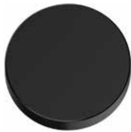
13 - Matt Black RAL 9005