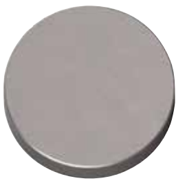
P5 - Matt Gun Metal PVD