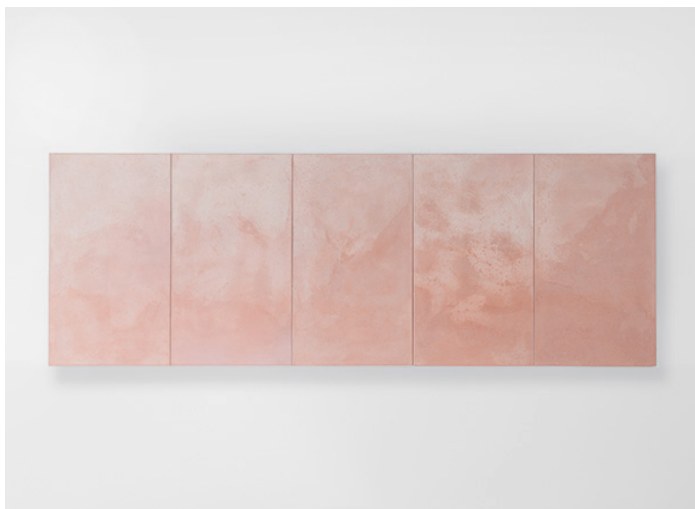
Concreto, Seres CON024S