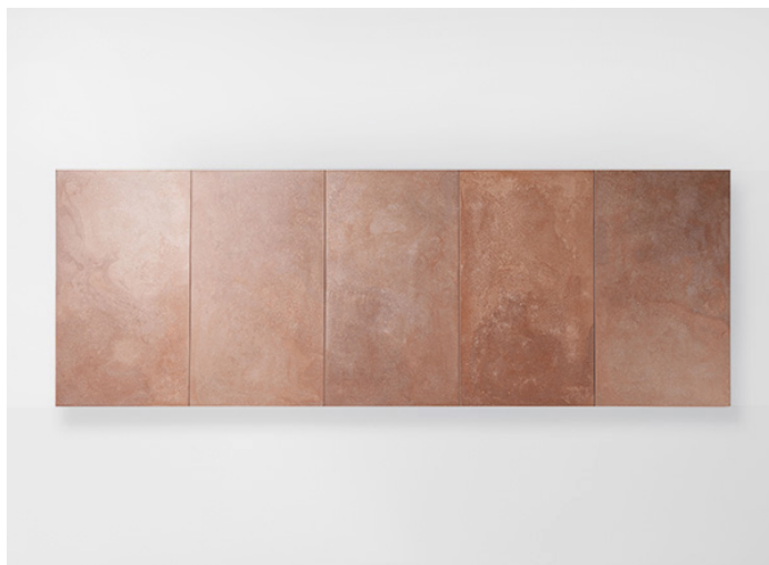
Concreto, Seres CON0A1S