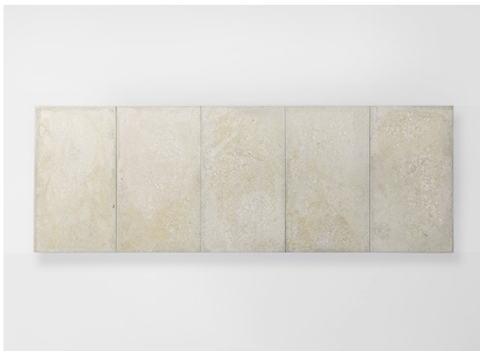
Concreto, Seres CON20BS