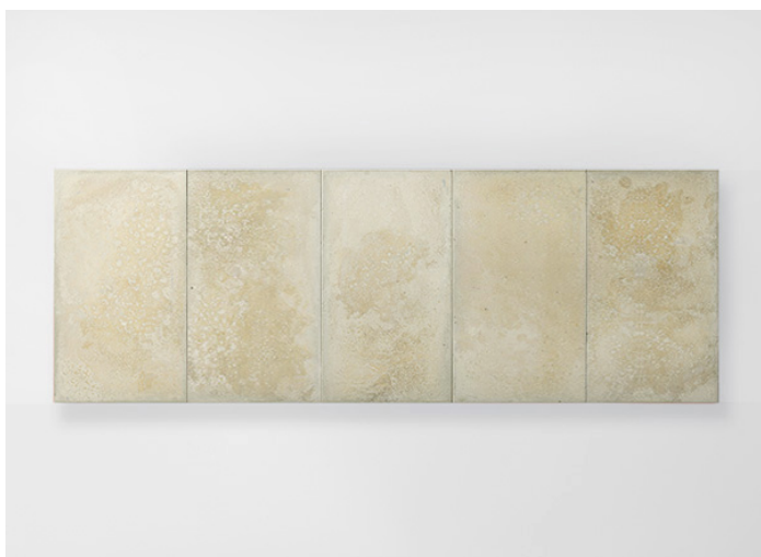
Concreto, Seres CON17S