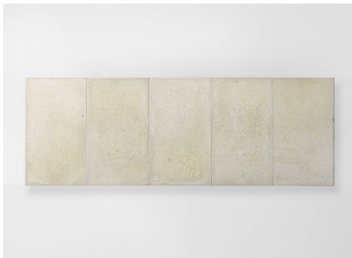
Concreto, Seres CON17BS