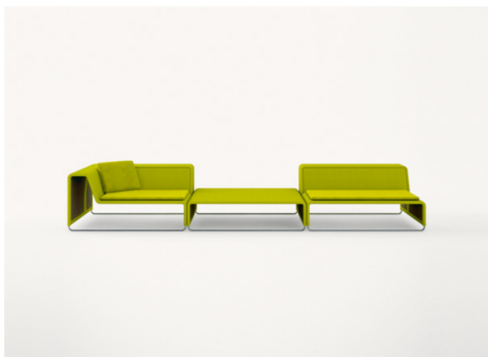
B11S + B11PB + B11C