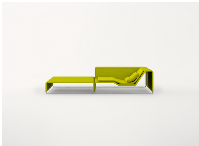
B11PB + B11CLD