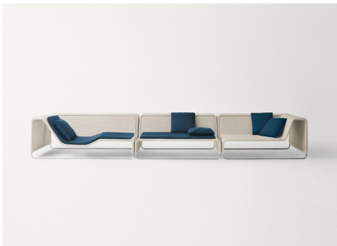
B11CLS + B11C + B11D