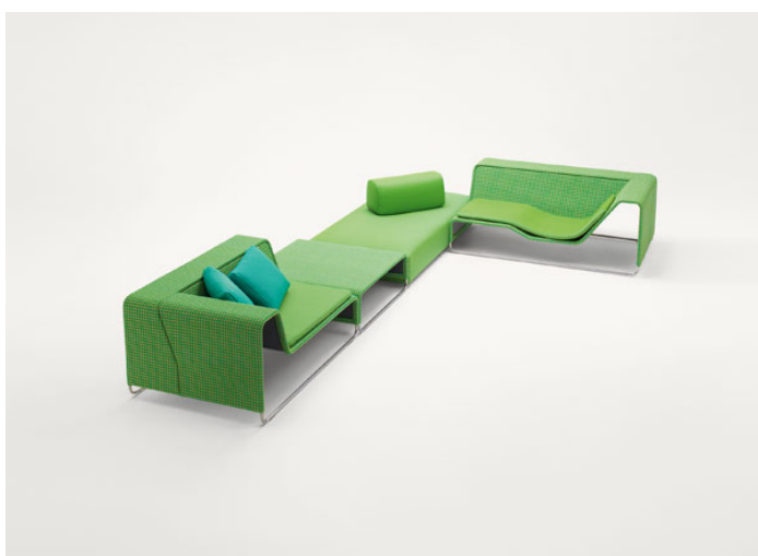
Island B11S + Island B11PA + Orlando B77B + Island B11CLD