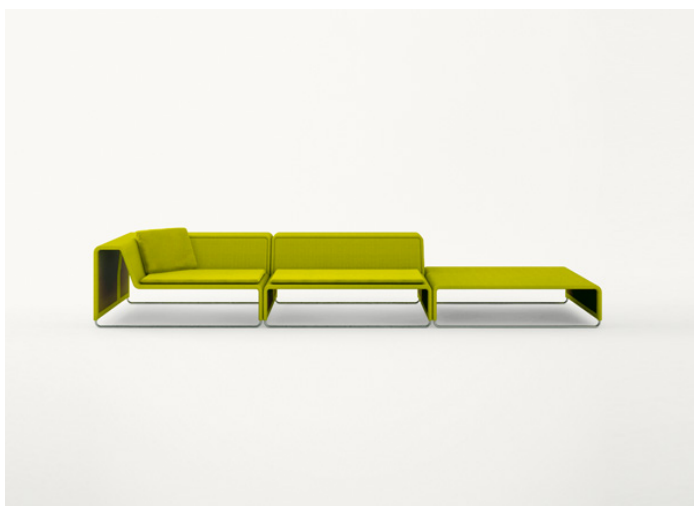
B11S + B11C + B11PB