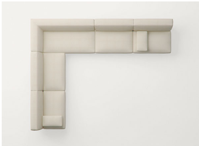
n°2 B93DB + B93XSB + n°2 B93S