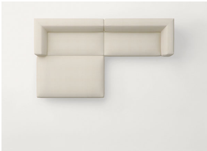
B93XSB + B93XDB + B93M