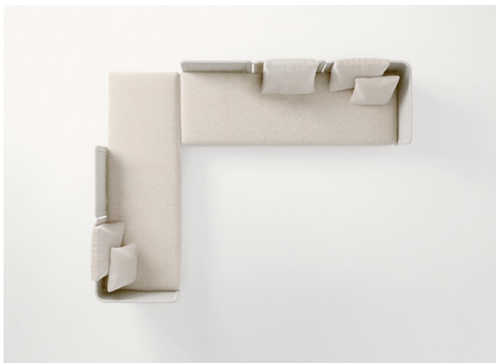
B39MS + B39ED