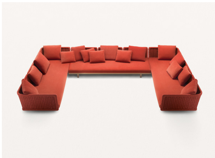
n° 2 B39B + B39F