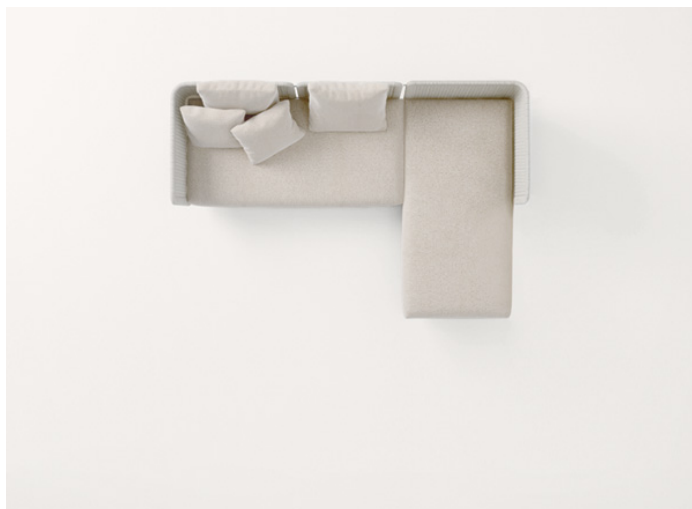
B39CS + B39NS