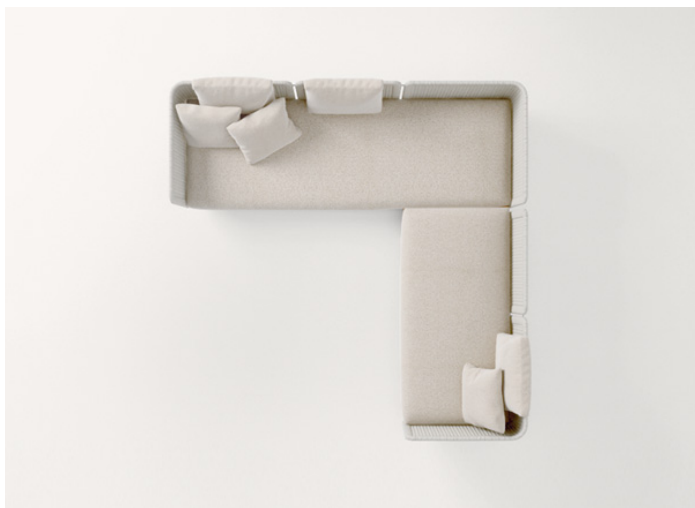
B39B + B39CD