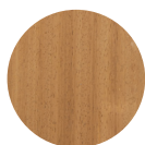
K1 IROKO NATURAL