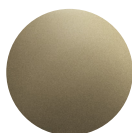
X03 METALLIC CHAMPAGNE